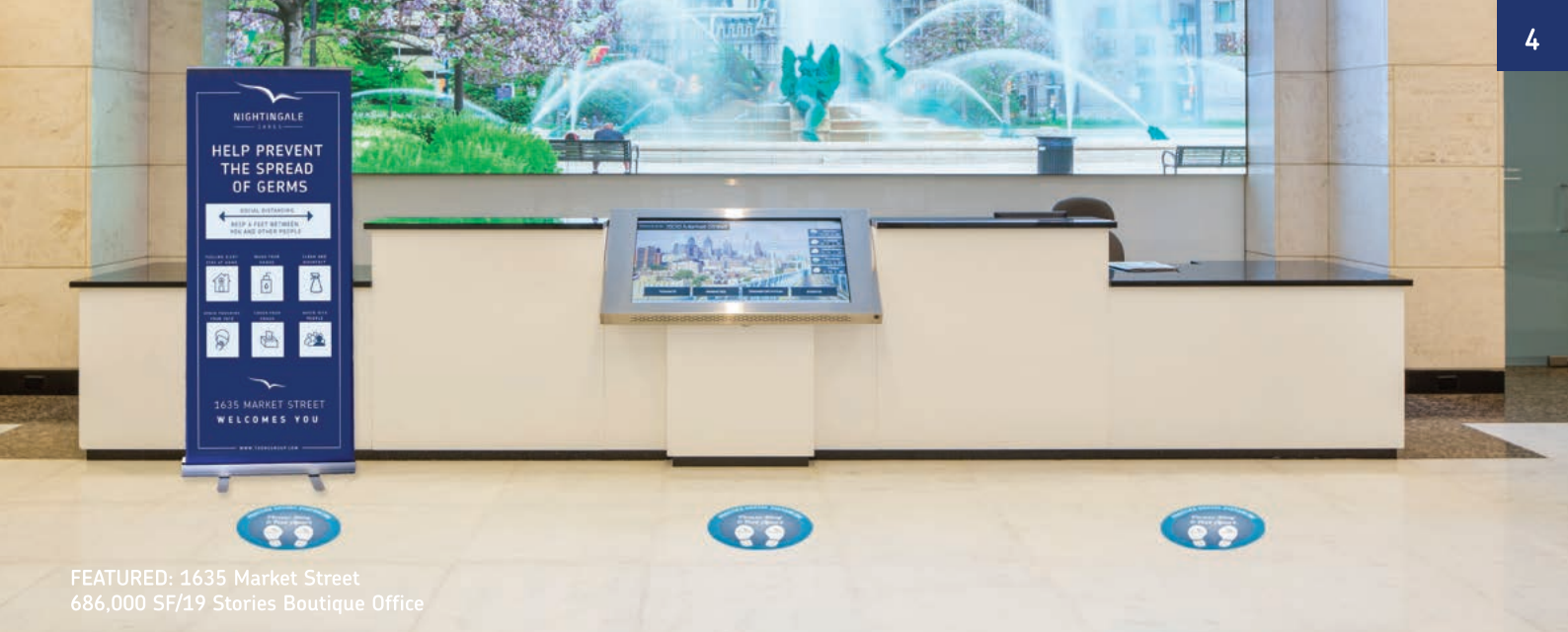
FEATURED: 1635 Market Street 686,000 SF/19 Stories Boutique Office