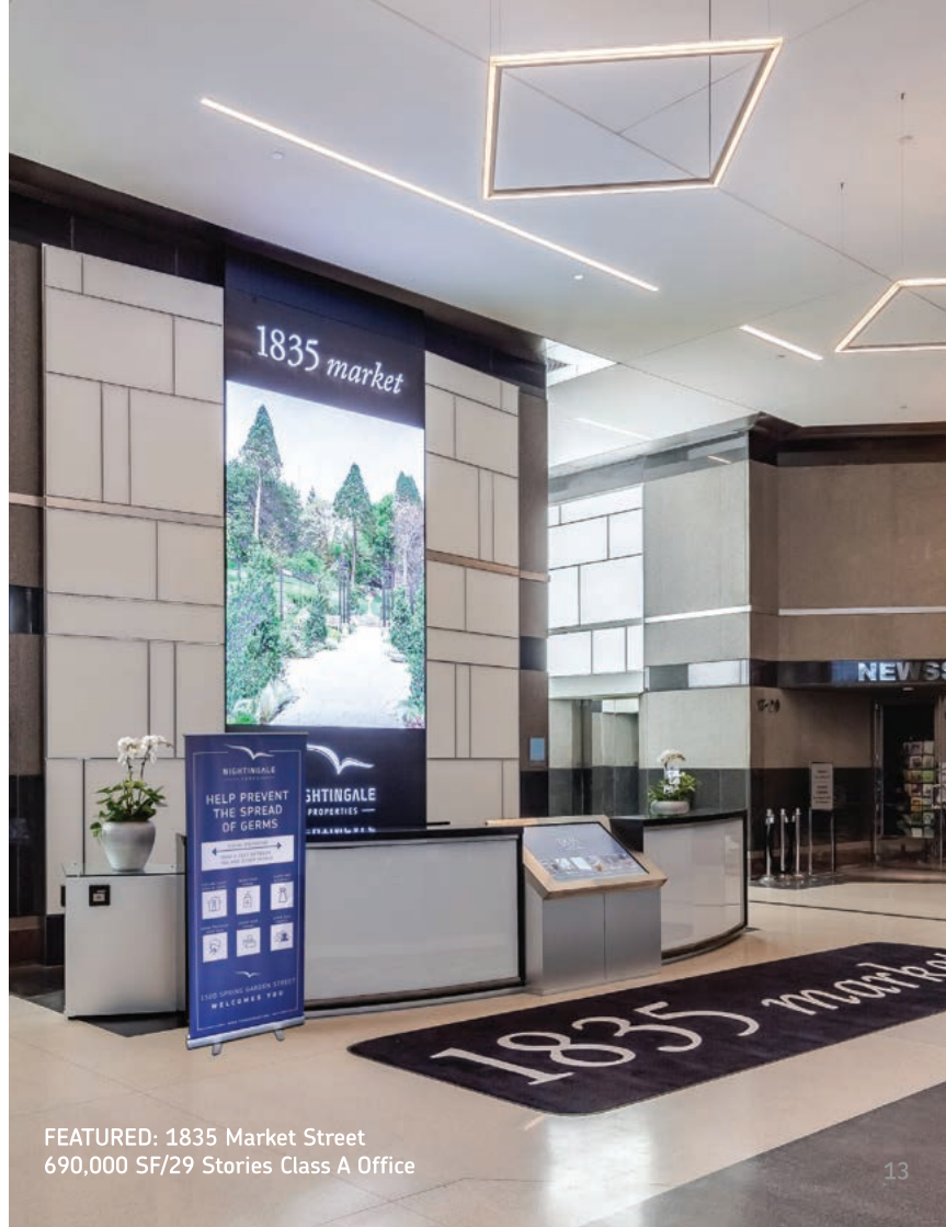
FEATURED: 1835 Market Street 690,000 SF/29 Stories Class A Office

Buildings with garages, managed by Nightingale, will continue self-parking operations, with hand sanitizers at entrances to all buildings.